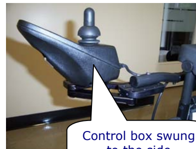
Control box swung to the side